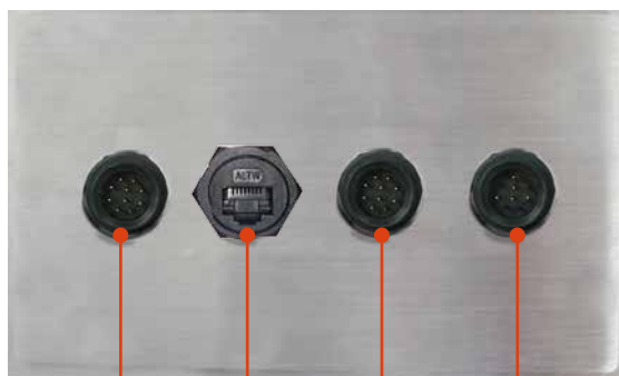
2 x USB LAN COM2 Power